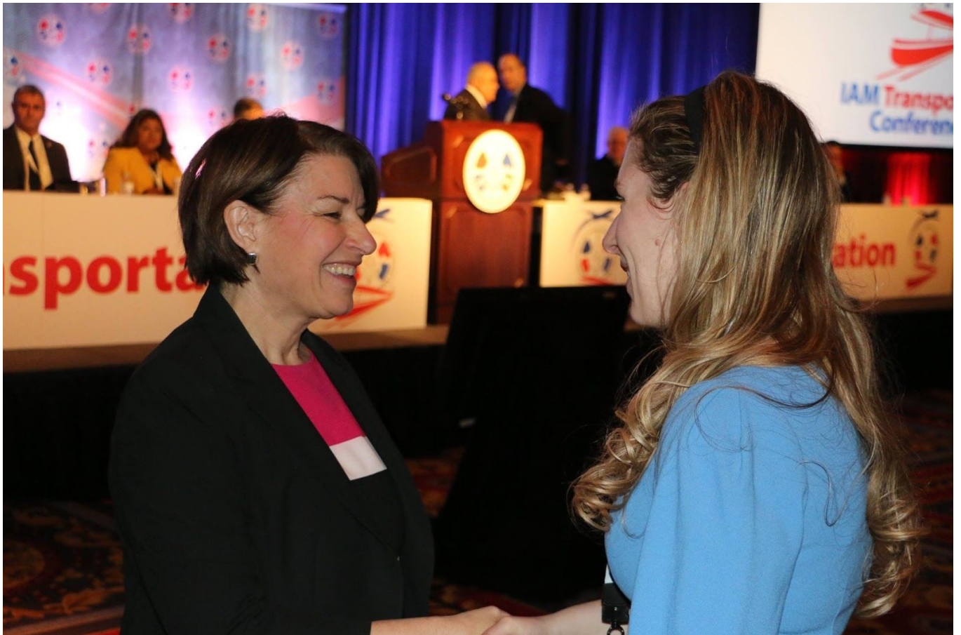
After her speech, Senator Klobuchar spent time speaking with delegates and posed for pictures.

The IAM Transportation Conference assembles the top union activists within the railroad and airline industries. The event is being held this week in Las Vegas, Nevada, and will run through April 11.