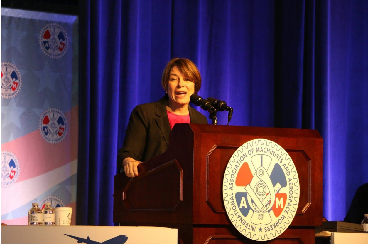
Senator Amy Klobuchar (D-Minn.) speaks before the 2019 IAM Transportation Conference in Las Vegas, Nevada this week.