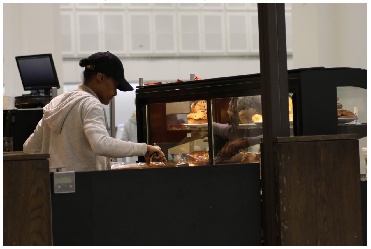
IAM141 Media Dept

When TSA security checkpoints close, they dramatically rearrange the flow of foot traffic around them. Airport restaurants and shops that depend on passengers with plenty of wait times walking past and patronizing their establishments are struggling to attract customers who now have little time or are not even in that part of the airport.